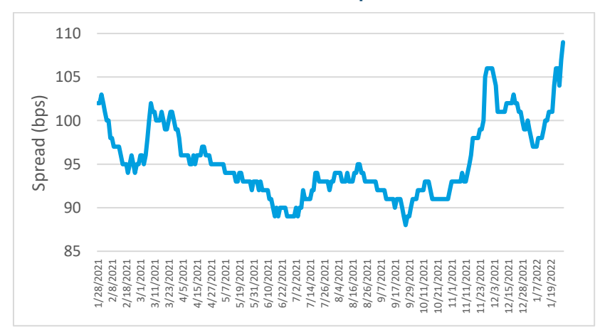
Chart of the week: Global investment spreads - LTM